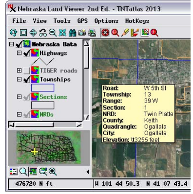
DVD atlas viewed in free TNTatlas

For more information see: <u>Tutorial on Printing</u> and Technical Guides on Geomedia Publishing and Publishing Web Maps at the MicroImages website.