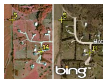
Use Bing Maps or any web layer to georeference your geodata