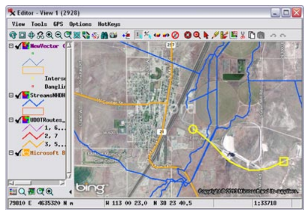
Edit over Bing Maps or any web tileset or WMS layer

In TNTgis you can supplement your local image, map, and elevation data with the rich resource of web-based geospatial data. You can view your data from any locale over a global reference image and map data from Bing Maps, or use one of the many on-line orthoimage tilesets hosted by Microlmages. Use any of these web resources as a reference as you create. edit, or georeference your local data. You can use web terrain tilesets hosted by Microlmages as terrain layers to view any of your local images (or MicroImages' on-line web tilesets) in stereo. You can also view layers published by any Web Map Service (WMS) or ArcIMS, with integrated catalog searching to allow you to select layers by text, geographic area, or address.