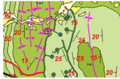
Geologic map point and line symbols created by CartoScript